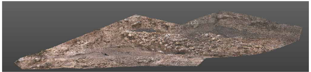
Points cloud area alfa Case bastione