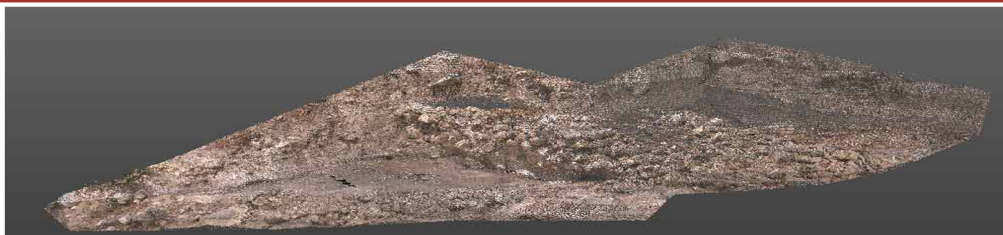
Points cloud area alfa Case bastione